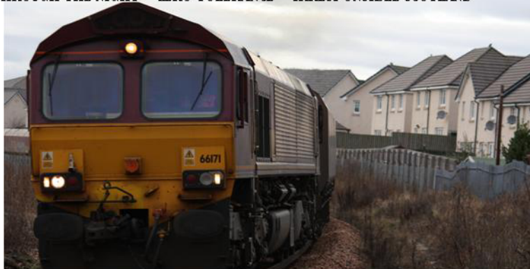
Too close for comfort for an uninterrupted nights sleep, the heavy coal trains rumble past day and night and buildings are set to crumble.

The noise also travels at night in open spaces, everyone in the rail line corridor is affected. Environmental reports through the consultation are proven as flawed, the goal posts changed through the process with zero consultation.