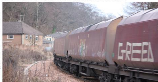
Graffiti on a wagon saying GREED, a recent standing room only public meeting, full of irate members of the public who only want a decent nights sleep gave the operators and politicians some in-depth thinking to do.